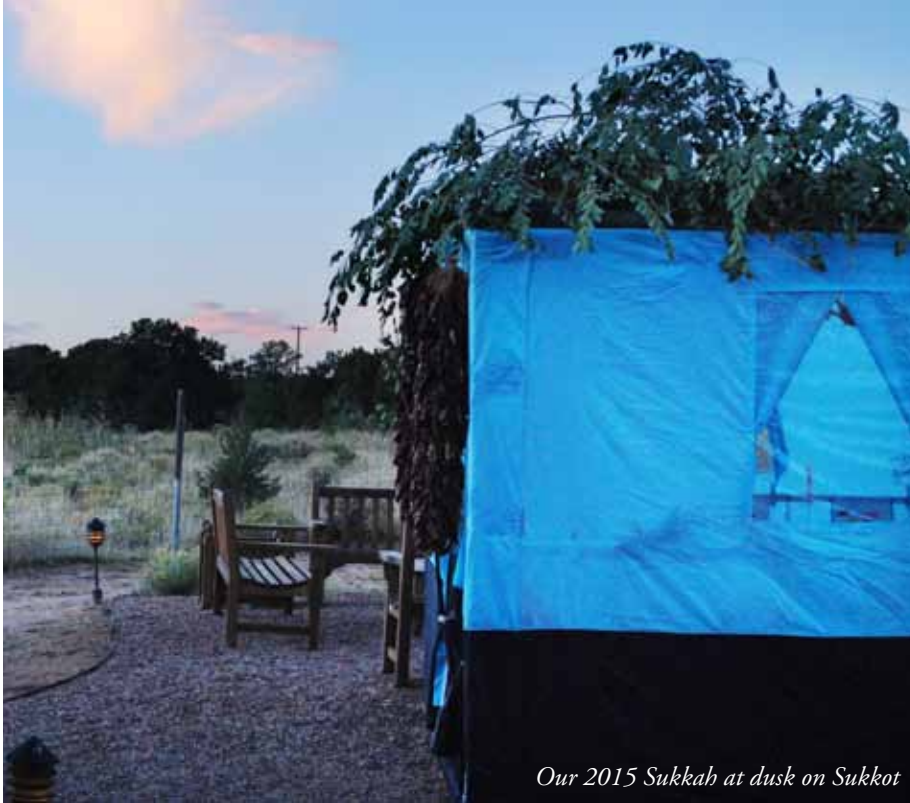
Our 2015 Sukkah at dusk on Sukkot

This October is filled with the festival of Sukkot, known as the season of ingathering, or the great pilgrim festival of the fall. We are also approaching the 20th anniversary of our congregation. Such an anniversary and the season of Sukkot have much in common. For this is a time when we are awed by nature's beauty and we also recognize the early fruits of our harvest. Our synagogue family has grown, we have a vibrant religious school, and we have accomplished so much in the past year. We celebrate Sukkot in a beautiful but fragile booth, and yet our own building has expanded and offers us endless possibilities for the future. This is truly a season to give thanks, and acknowledge all that we have achieved in the past two decades. Sukkot is called the festival of joy, and truly we can rejoice and laugh as we embark on our new journey.