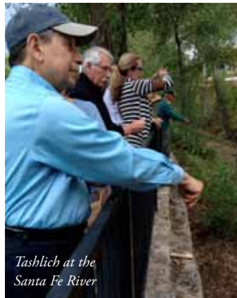
Tashlich at the Santa Fe River