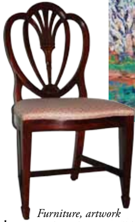
Furniture, artwork and much more will be included in the silent auction and sale.